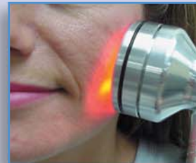
Blue & Red / Infrared LED Light