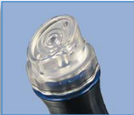
Patented Disposable HydroPeel™ Tip

Multiple Modalities Offering The Ultimate HydraFacial™ Treatment.