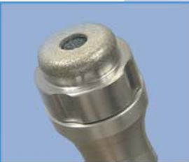
Patented Diamond Abrasion Tip